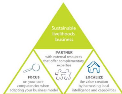
Fig. 3. The sound foundations of sustainable livelihoods business.