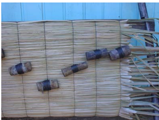
Fig. 2. Straw with taboa's fiber.

So much the as much as problems the local potentials were identified, initially by Marli Luisa, inhabitant of the region and holder of a commercial establishment in the localities. She can be